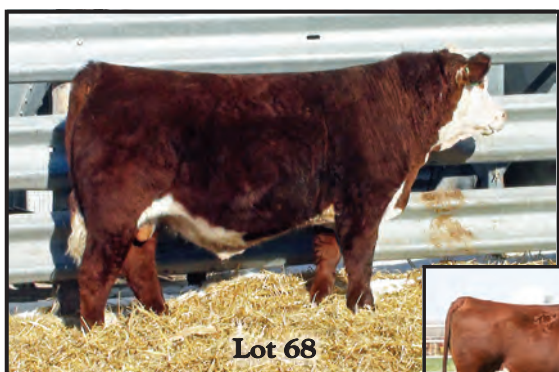
Dam of lot 68 ----->

Heavy muscled, deep middled, easy doing, dark colored son of the popular Hometown 27A! Dam was top selling female in Mohican's 2016 sale. She has wonderful depth, udder quality & eye appeal with a 112 WWR on her calves! He has very balanced EPDs ranking him in the top 10% for Milk, M&G and REA. Also we have sent in DNA for GE-EPDs and polled testing. Selling 1/2 interest and full possession.