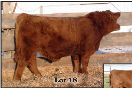
84Y mother of lot 18 >

Another well muscled, higher performance Buckshot bull! Same great cowfamily as the bull above. Entourage was Denver Bull Calf Champion for Lodoens and bred by OHR. 56N was top selling cow in Santa sale at $14,500 to Majestic Meadows!