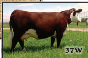
Dam of lot 57 ---> Embryos for sale by Trump.