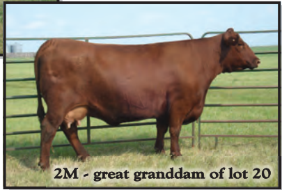
2M - great granddam of lot 20