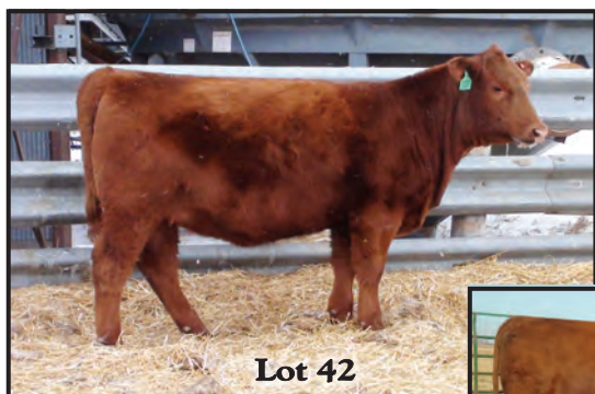
107J - granddam of lot 42 &gt;

Complete, high quality heifer that has show potential. Dam is 12 years old and might be our best Copper daughter ever - 103.4 MPPA! The grandmother is the original Annabelle cow that started it all for us and tallied up a 109.2 MPPA! 30 on milk puts her in top 3% of the breed!