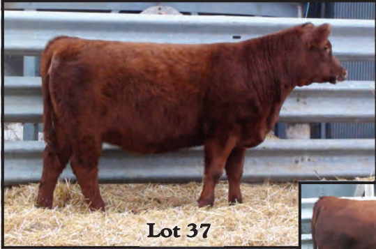
154C - Sire of lot 37 >

One of the better heifers in this sale - She has the thickness, volume and look to go to the shows. Sire is super stout, easy doing and very dark. His dam is one of our best and most powerful Trust daughters With a 102.9 MPPA. Grandmother on bottom has a 107.2 MPPA! Pedigree estimated EPDs because we are waiting on DNA from sire.