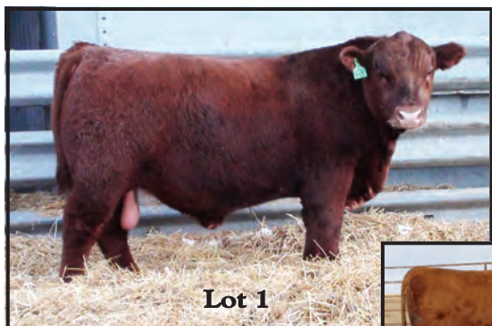
18B, full sister to dam of lot 1 >

Powerful Buckshot son with extra muscle, depth, length of body and performance! Dam is from great Annabelle cowfamily and sired by our performance and maternal expert - Game Plan! Top 5% of breed for WW and Top 8% YW. Big time herdbull prospect here!