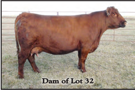
Dam of Lot 32

Another powerful Hobo son! With a negative BW EPD and 79 pound weight he would work for breeding heifers. 23Y is big volume, good Uddered and easy on the eyes. Her mother was much the same with a 102.6 MPPA.