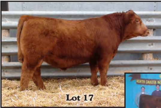
14M, grandmother of lot 17 Supreme Champion Female NDWS >

Big hip and butt on this high performance, deep ribbed Krugerand son! We are waiting on DNA confirmation for his registration to go through so EPD's are parentage estimates. Dam is from our great Mahogany line known for great udders, high volume and eye appeal. Granddam was Supreme Champion at 2004 ND winter Show - 103.1 MPPA!