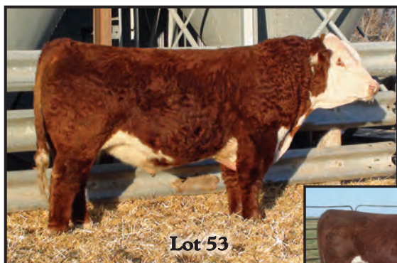
Granddam of lot 53 ---&gt;