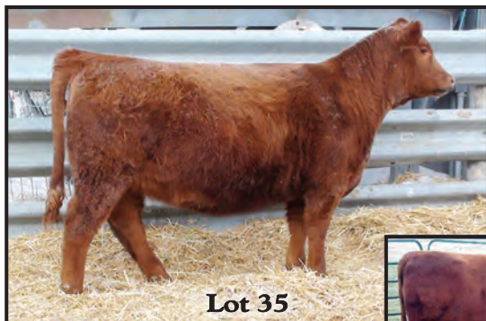
9010 great grandmother of lot 35 >

Nice made, moderate sized daughter of our young outcross sire Vessel. This heifer was a twin to another heifer weighing 54#. Dam is a very nice first calf heifer who's dam has a 104 MPPA and Grandam 105.2! Looks a lot like her great grandmother pictured below!!