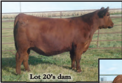
Lot 20's dam