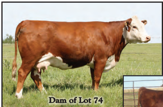
Dam of Lot 74

Fancy late March heifer raised by our 14 year old Effie cow that has written a big chapter her at OHR! She consistently brings in a good one and has a production ratio of 103. She has one of the best 2 year old bulls in the sale this year, a $4000 bull last year and a $5500 heifer pictured below to name a few! This heifer is a breed improver for 17 of 20 traits and top 10% for REA, Fat and CHB. She's a genetic gem!