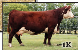
Granddam of lot 58 -----> Embryos for sale by Hometown, Redeem, Vision and Progress 30S