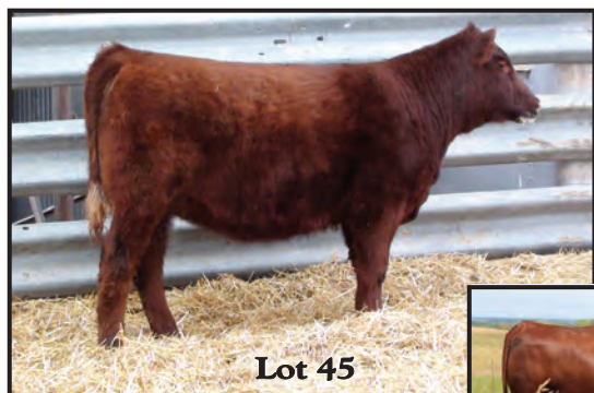
0124 - dam of lot 45 >