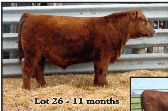
Lot 26 - 11 months