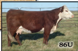
Granddam of lot 71 ----->