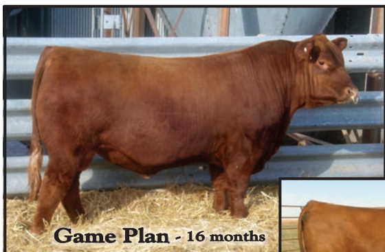
Game Plan daughter -->

Dam was one of the top sellers in Pieper's cow sale. She boasts a 113 MPPA! This bull puts a very attractive look on his calves with good muscle and performance. Progeny have measured very well for REA and Marbling. This bull consistently produces some of our top sellers! Contact us for semen on Game Plan!