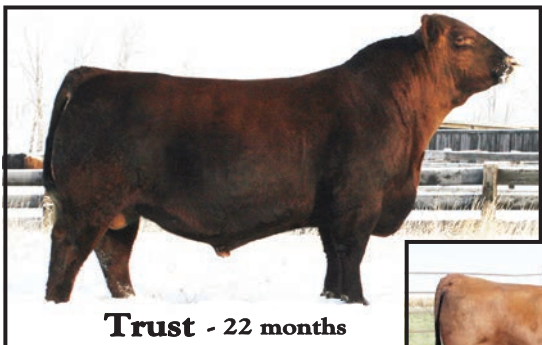
Trust - 22 months