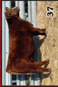
The Region's Red Angus & Polled Hereford Performance Leader!