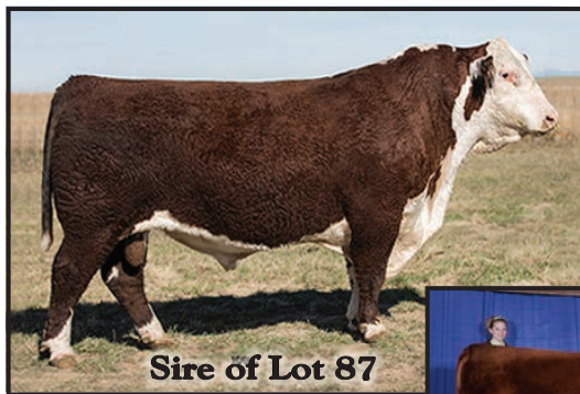
Sire of Lot 87