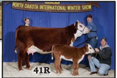
Great Granddam of lot 61 --->