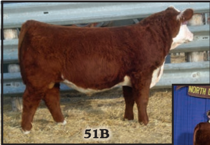
Sire of lots 61 & 62 - 10 months

Big, long sided, short marked bull sired by Homefront who topped our Sale in 2015 at $9500 to Hillsvie and Woodcrest. Another full brother sold last year to Bill Isaacson for $7000. Dam raised him as a first calf heifer(105 WWR)- she traces to one of our best Kodiak daughters! We used him on heifers last year. Top 10% or better for WW, YW, M&G, Scrotal & REA!