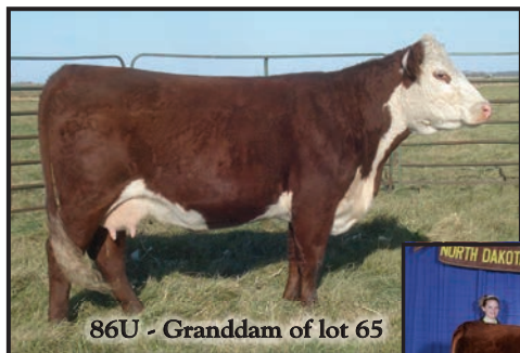
86U - Granddam of lot 65

Great granddam of lot 65 ---> Champion Female 1997 NDWS