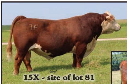
15X - sire of lot 81