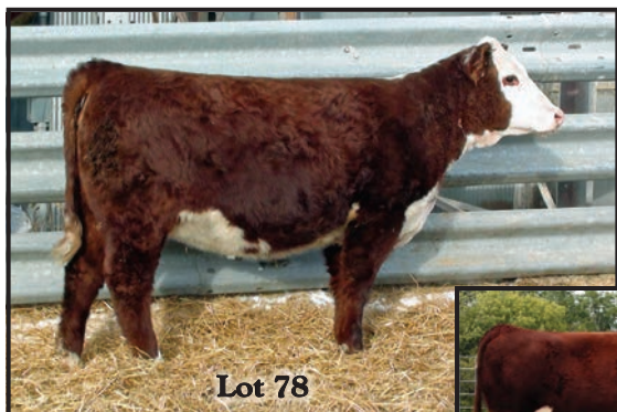
Grandmother of lot 78 -->

Attractive, angular, conservatively marked heifer with show potential! Dam is a very good daughter of National Champion, Trust, and out of our powerful donor -1K. 1K sons topped this sale last year at $7000 and 3 years ago at $9500. Top 10% or better for YW, CEM, Udder Suspension and Carcass Wt. Top 20% for WW, Sc, REA and CHB!