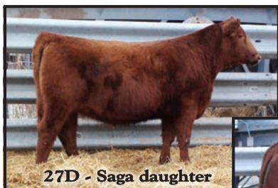
27D - Saga daughter

Saga has a good birth to weaning and yearling spread. He had a 14.5 REA, .32 backfat and 4.78% IMF. Saga calves are dark colored, correct and have extra muscle and thickness. Both heifers and bulls are very high quality. His performance numbers continue to go up with his third calf crop now in the books. Saga makes them correct and easy to look at!