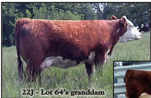
22J - Lot 64's granddam

Maternal Sister to lot 64 ---> High selling heifer in 2016 sale!