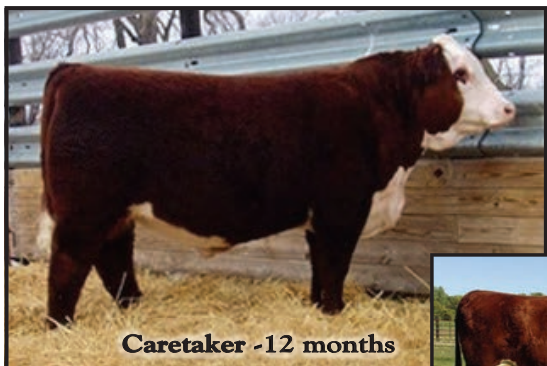
Caretaker -12 months

Homozygous Polled! Heavy muscled, high performance, deep middled, dark colored and short marked bull from a great cow family. Dam has a 109 WWR, granddam is 105.3 and great granddam is 106.5 & DOD! 14.95 REA, 3.42 Marbling, and 39 scrotal. Top 5% of breed for WW, YW and Carcass Weight. Top 20% or better for REA, CEM & US. Owned with Dakitch Hereford Farms, Mn. Semen available.