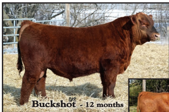
Buckshot's dam ~ ~