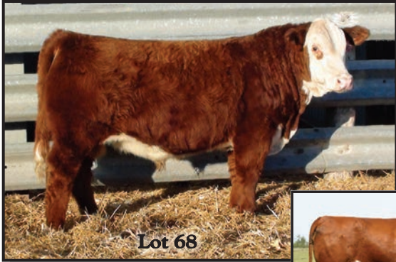
Granddam of lot 68 --->

Long bodied, high performance bull with good muscling and 100% pigmentation. Grandmother Effie is ideal in size, type and udder with a 103.7 WWR - still in our herd at 14 years old! 47R, grandmother on topside is still in our herd at 13 years - she's a DOD with 111 WWR! Twin to 70# heifer that was split and raised by a foster dam from birth. Longevity, productivity and one of our best young bulls!