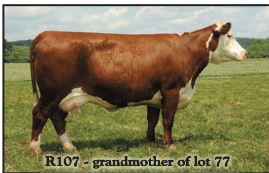
R107 - grandmother of lot 77