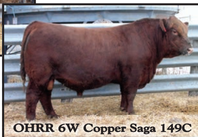
OHRR 6W Copper Saga 149C

A feature 2 year old that sells in this sale! He is a maternal brother to reference sire D!