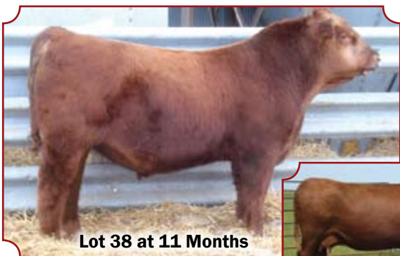
Lot 38 at 11 Months

Great bull. Kept back last year to breed heifers for many reasons: superior dam, great EPD's performance records, good disposition and a son of Mulberry - popular Canadian Sire. Study this bull! We think he'd be a great addition to any program.