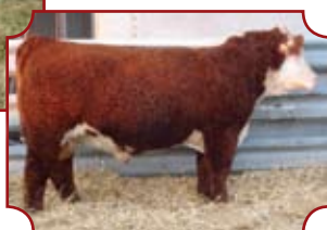
51S Son of Lot 74 ->