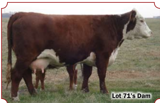
Lot 71's Dam