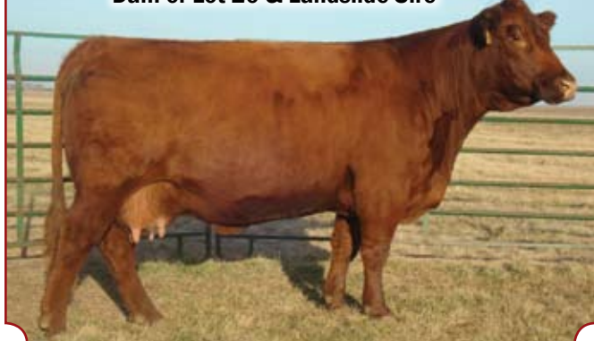
Dam of Lot 20 & Landslide Sire