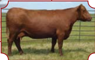
Lot 38's Dam ->