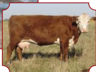
Lot 65's Grand Dam ->