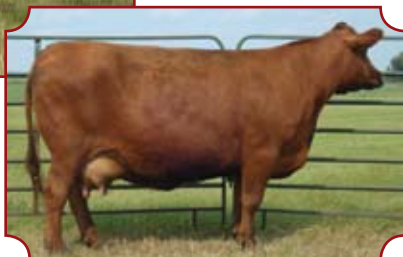
Lot 33's Grand Dam -&gt;