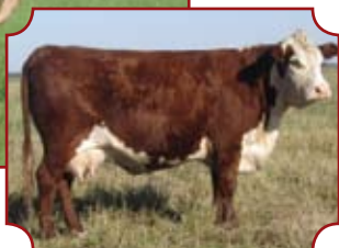
Lot 64's Grand Dam ->