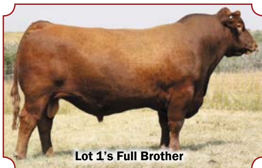
Lot 1's Full Brother

2010 Spring Red Angus Breed EPD averages - (Non Parent)