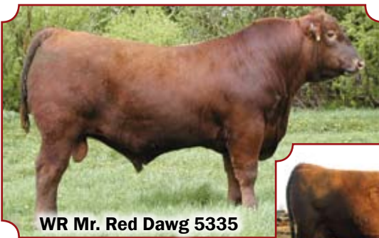
WR Mr. Red Dawg 5335