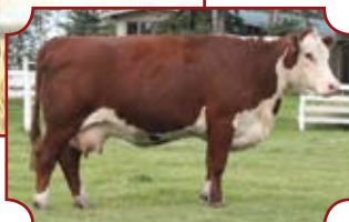
Lot 56's Dam - >