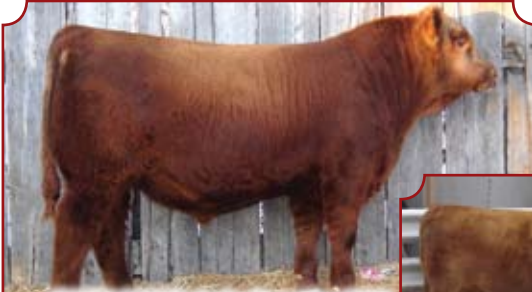
OHRR 10H Dakota Rambler 75R