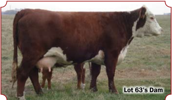
Lot 63's Dam

Big, long sided son of Masterpiece from one of our favorite Kodiak daughters. Both of the grandsires are Sires of Distinction and CHB leaders. Dam has a production WWR of 107. In the top 20% of breed for WW, YW, Scrotal, M & G, REA and CHB indexes.