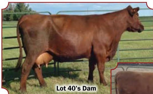
Lot 40's Dam