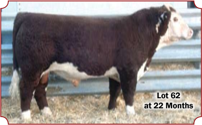
Lot 62 at 22 Months

Good, complete ET bull from Betty who's dam and granddam are both Dams of Distinction. We bought into Prime Up after seeing his $54,000 mother. This bull is a breed improver for 11/15 categories and in top 24% for WW, Scrotal, REA, Marbling, BMI and BII Indexes. Should work really well on heifers!