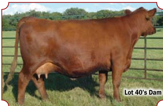
Lot 40's Dam

Fall bull. Out of beautiful and productive 9930 cow. Her bulls have performed and sold well and her daughters have stayed here. 102U was too young for the 2009 sale - but he's a good one!!