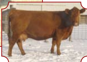
Lot 28's Dam - &gt;