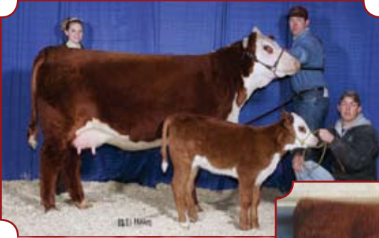
Dam of 78W - Grand Champion at 2007 ND Winter Show as a first calf heifer.