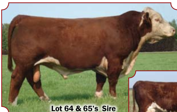
Lot 64 & 65's Sire