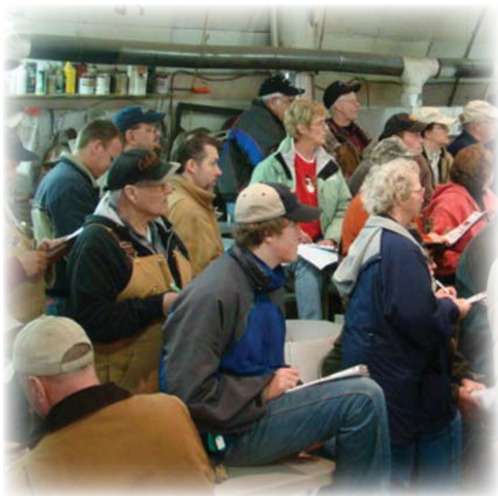
OHR's 2009 Red Power Bull Sale!

Owned with: Northline Red Angus - Ardossan, Alberta