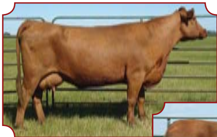
Lot 32's Grand Dam