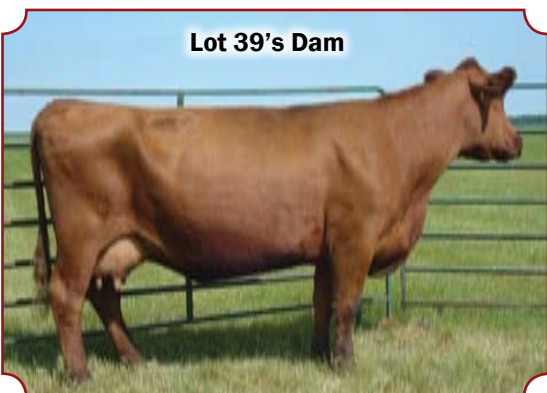
Lot 39's Dam

A two year old heifer bull with loads of carcass and maternal power. Dam 78L is Explorer 740 out of the great 9J cow. Red Canyon (OSF) one of the top sons of Grand Canyon.