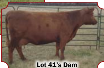
Lot 41's Dam