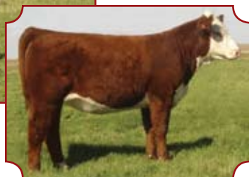
Lot 75's Maternal Sister