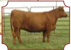
Lot 7's Dam - >